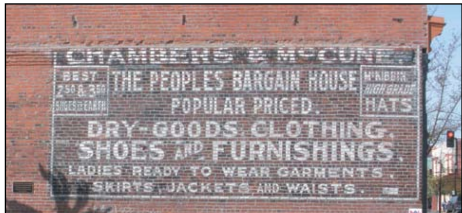
Above: Advertisements painted on commercial buildings were popular in Albany as well as on Main Street buildings across America. Signs like these, still visible today are called "ghost signs." This sign is located at First Avenue near Lyon Street. Other ghost signs can be seen on Albany's downtown buildings if you look closely.