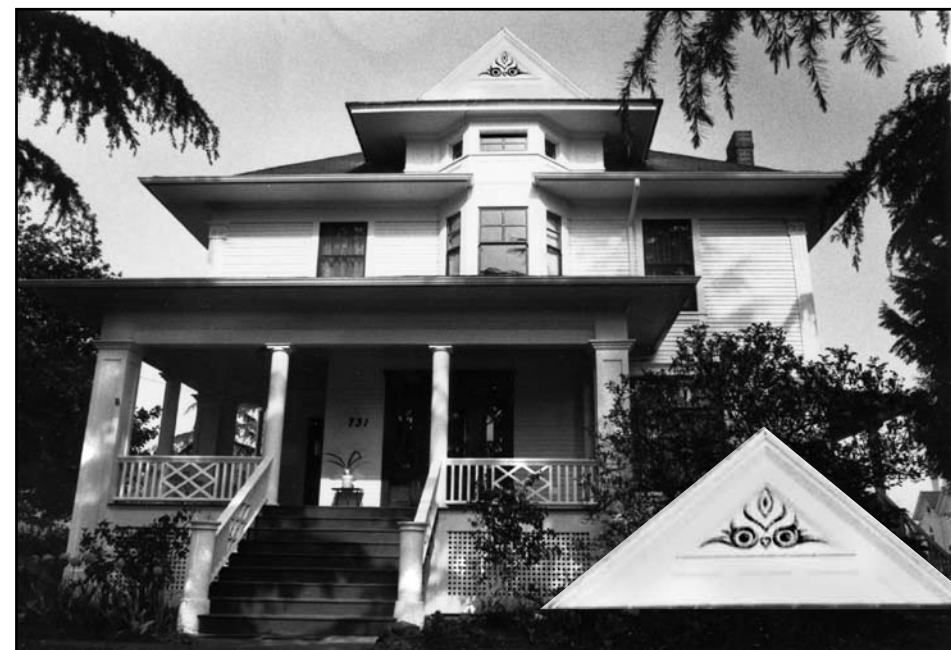
Left: Dawson House (7) Built in 1910. by the owner of the Owl Drug Store. Note the "Owl face" on the top gable.

In 2000 the National Register nomination was amended to adjust the period of significance to include the years from 1915 to 1945, thus adding single- and multi-family residences constructed in the district as infill between WWI and the end of WWII. These resources included excellent examples of Craftsman, Bungalow, Colonial Revival, Minimal Traditional, and Depression/World War II-Era Cottage styles. The Monteith District boundary was officially expanded November, 13, 2008, to include 78 properties abutting the original district that share a similar historic association and feeling.