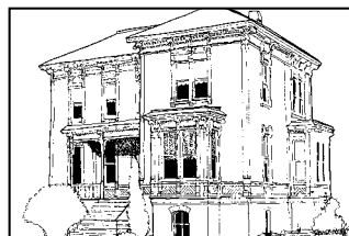
Goltra House c.1893 (18)