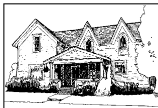
Moses Parker House c. 1875 (42)