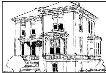
Goltra House c.1893 (18)