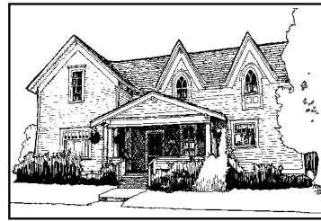
Moses Parker House c. 1875 (42)

Begin the Hackleman District Tour at the Albany Station. The Railway Express Agency (REA) building is just to the east (1&2). These Craftsman style buildings were built in c. 1909 and are the Amtrak office, rail stop, and Albany Transit offices today. Proceed onto Lyon Street, you will see the Charles E. Wolverton House, 810 Lyon SE (3), a c. 1889 Italianate. Wolverton was an attorney, district court judge, federal district court judge and Oregon Supreme court justice. Across the street, at 733 Lyon SE (4) is another Italianate home, dating back to 1892. It was the home of J.W. Cusick, a banker. Continue down Lyon and turn right down Sixth Avenue, just beyond the fire station. Turn right again on to Baker Street. The rural vernacular house at 606 Baker St. SE (5) was built in 1875. The Eastlake Stick style home at 632 Baker St. SE (6) is perhaps the most elabo-