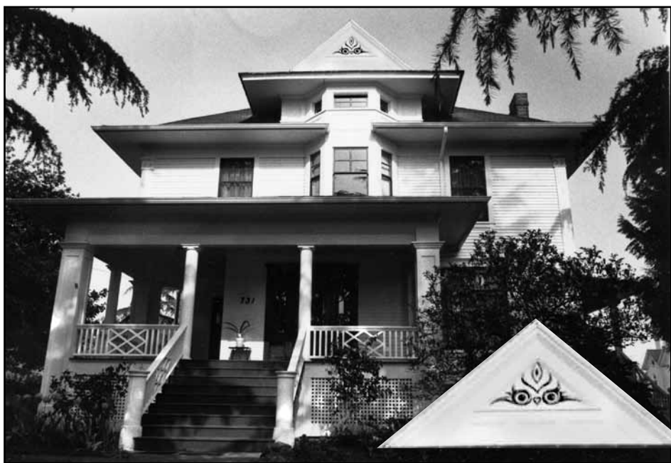
Above: Dawson House (40). Built in 1910 by the owner of the Owl Drug Store. Note the "Owl face" on the top gable.

In 2000 the National Register nomination was amended to adjust the period of significance to include the years from 1915 to 1945, thus adding single- and multi-family residences constructed in the district as infill between WWI and the end of WWII. These resources included excellent examples of Craftsman, Bungalow, Colonial Revival, Minimal Traditional, and Depression/World War II-Era Cottage styles. The Monteith District boundary was officially expanded November, 13, 2008, to include 78 properties abutting the original district that share a similar historic association and feeling.