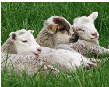
"Lambing Season" by Cathy Flowers

The oldest fair of its kind in Oregon includes sheep shows, fiber arts, crafts and Northwest Champion Sheep Dog Trials. Scio Fairgrounds, 38764 N Ash St, Scio, OR 97374. Lambfair.com