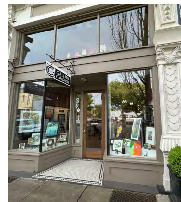
"Gallery Calapooia" by Lonna Capaci

The Gallery Calapooia First Friday Reception. 6-8 p.m. Gallery Calapooia is located in the historic Flinn Block, an 1887 French Second Empire building on 1st Avenue. The 19th century building has a beautiful cast iron façade and a spacious interior with old brick walls, making it a wonderful setting to view fine art. 222 1st Ave. W Albany. Regular gallery hours: Tuesday-Saturday, 11a.m.-6 p.m. 541-971-5701 Free.