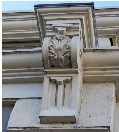
"Vintage Scroll Work" by Cathy Webb.

Albany Farmers' Market every Saturday, 9 a.m. - 1p.m. Purchase hand-picked produce, fresh flowers, baked bread, local eggs/meats and more at Albany Farmers' Market. 4th & Ellsworth, City Hall parking lot. locallygrown.org . Free.